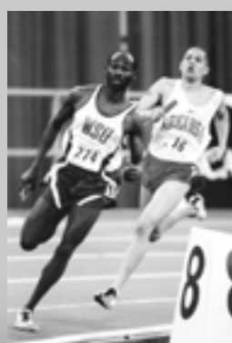
Bernard Lagat 2000 (Bronze medal) & 2004 (Silver Medal) Olympian, NCAA Indoor and Outdoor champion, NCAA Indoor Male Athlete of the Year, Pac-10 Athlete of the Year.