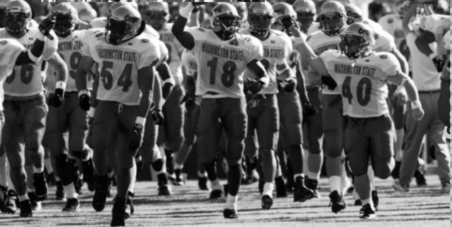
1998 Rose Bowl team